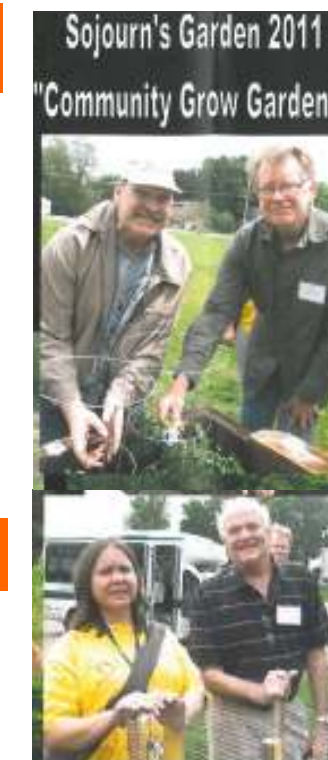
See their thank you posted on the bulletin board near the hospitality table.