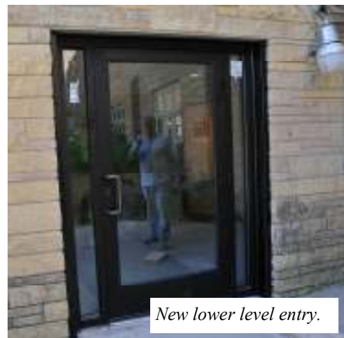
New lower level entry.